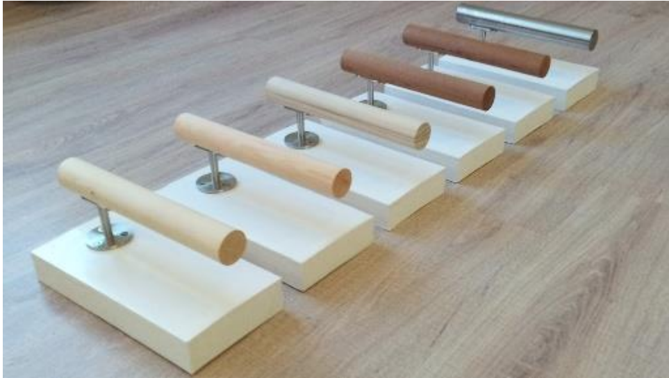
Figure 1: Handrail samples (from left to right: unmodified spruce, unmodified pine, acetylated radiata pine, thermally modified pine, thermally modified spruce, stainless steel)